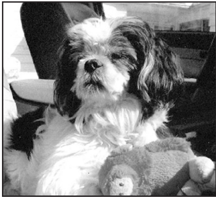
Coco, a nine-year-old Shih Tzu, is available for adoption.

Did you ever think that maybe old dogs find new tricks boring and that's pretty much why they won't let you teach them? It is quite possible that they may find you and your silly bag of new tricks just a little over-the-top.