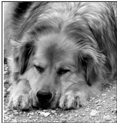
Burt, a nine-year-old Golden Retriever/Saint Bernard mix, serves as one of the Sanctuary's resident therapy dogs.

Which brings us to the human obsession with aging (as if dogs care how old they are): Exactly when does a dog become a senior? After all, it's not like they're receiving the dreaded AARP card in the mail the moment they turn fifty. It turns out, that just like humans, dogs are not all alike when it comes to aging. Certain breeds, mixed breeds and smaller dogs, in general, tend to