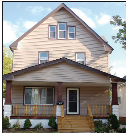
4012 Henritze After