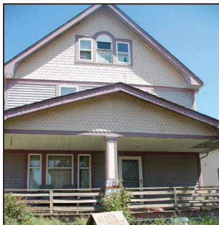
4012 Henritze Before