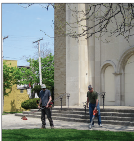
The former Blessed Sacrament Church

In a touching tribute to the buildings' histories, for now Bay Pres has been referring to their new endeavor as the Family Ministry Center at Blessed Sacrament . Their vision statement for the Center says in part, "We believe that God is glorified when Christians of different traditions work in unity to demonstrate in tangible ways the love and transforming power of Jesus Christ."