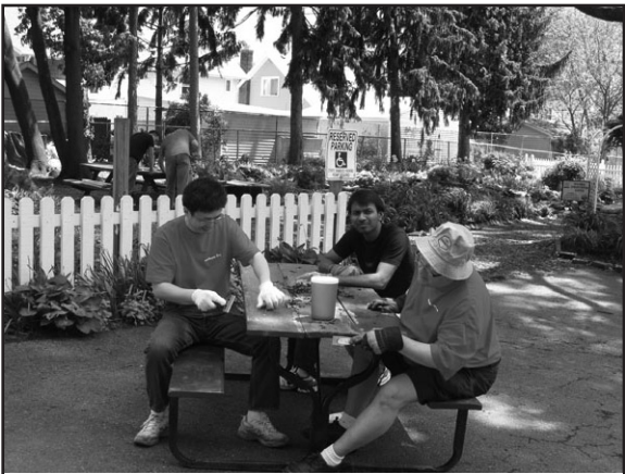
On May 24th, volunteers from KeyBank helped prepare the Ben Franklin Garden for the season.